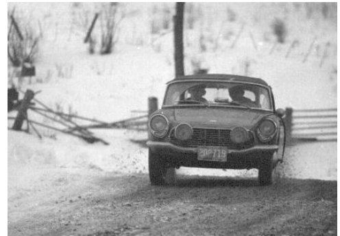
Dave Fairhall, Honda S600, on Mamette Lake Road, TBird 66